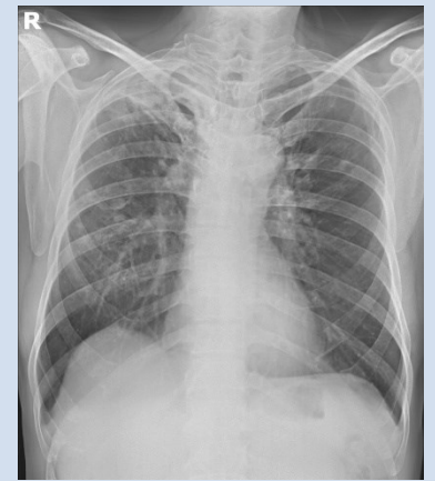
Read as positive (DRTECH) CAD4TB score: 80.3