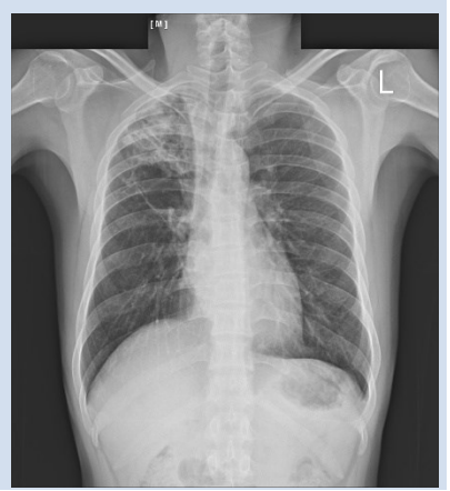
Read as positive (Sitec) CAD4TB score: 80.4