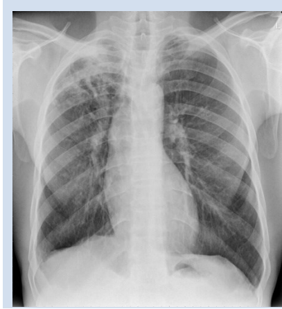
Read as positive (Canon) CAD4TB score: 80.9